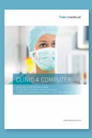
Order no. DS-FN-SIC-122