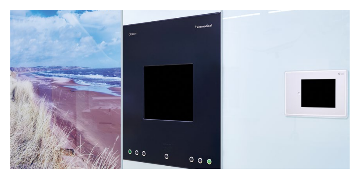
OPERION 319 with AccuTouch®, Marienkrankenhaus Hamburg

"In future projects, too, we will certainly be happy to return to the specialist knowledge and products of Rein Medical," says the Head of Medical Technology.