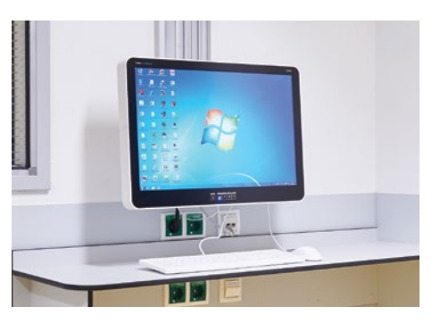
CLINIO 424C im renovierten Behandlungszimmer

In total, Rein Medi-cal supplied two 27" OPERION displays with PC for wall installation and one 55" OPERION display (4K) each for each operating theatre. The com-